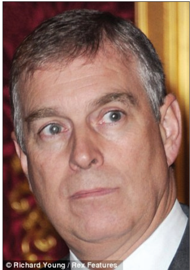
Scandal: U.S. authorities want to interview Jeffrey Epstein (left) and may wish to quiz his friend, Prince Andrew

Epstein's contacts book contains a work and a home telephone number for the senator.